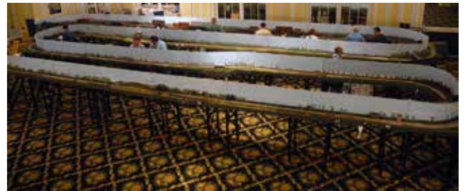
A balcony view of the Operations Roadshow layout.